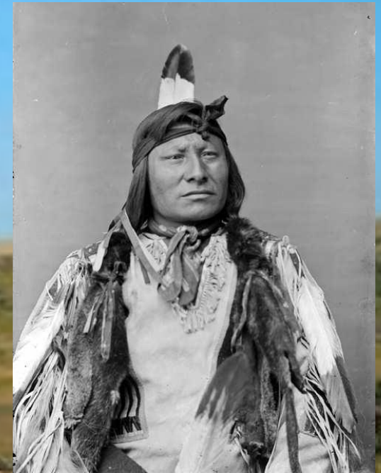
Rain in the Face