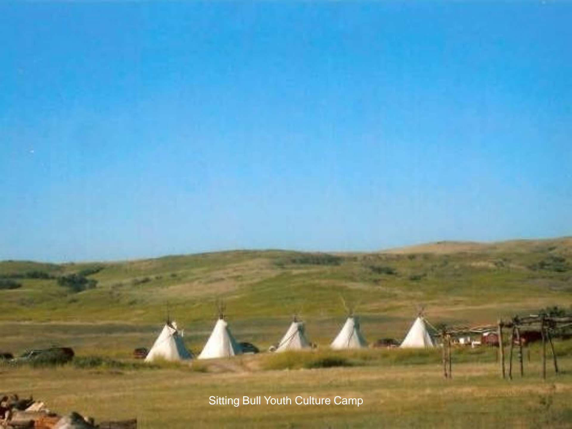
Sitting Bull Youth Culture Camp